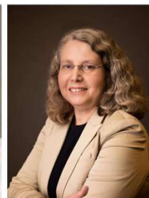
Lauren Jackson Councilor U.S. FDA